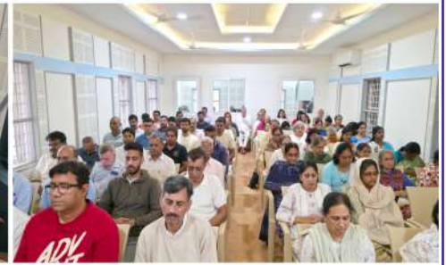
Gurujii's Mahasamadhi Day was observed at Taponagara on 23rd November 2025.